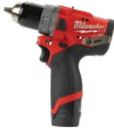
M12 FUEL 1/2" Hammer Drill/Driver