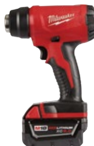
M18 Compact Heat Gun