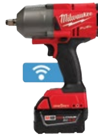
M18 FUEL w/ ONE-KEY 1/2" High Torque Impact Wrench w/ Friction Ring