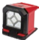
M18 ROVER LED Mounting Flood Light