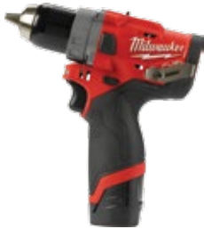
M12 FUEL 1/2" Drill/Driver

As the flagship of the M12 system, M12 FUEL tools are designed, engineered and built to deliver extreme performance and productivity. All M12 FUEL products feature three MILWAUKEE-exclusive innovations — the POWERSTATE brushless motor, REDLITHIUM battery pack and REDLINK PLUS intelligence hardware and software — that deliver unmatched power, run-time and durability on the jobsite.