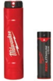
REDLITHIUM USB Battery & Charger Kit