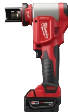
M18 FORCELOGIC 10 Ton Knockout Tool