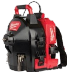
M18 FUEL SWITCH PACK Sectional Drum System Kit