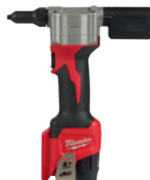
M12 Rivet Tool