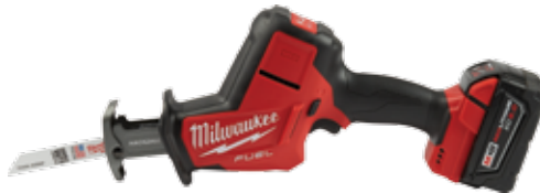
M18 FUEL HACKZALL One-Handed Recip Saw