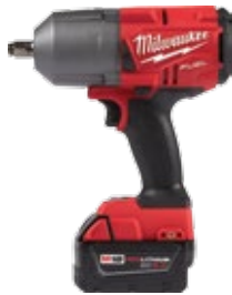
M18 FUEL 1/2" High Torque Impact Wrench w/ Friction Ring