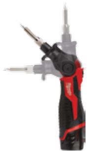
M12 Soldering Iron