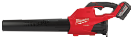
M18 FUEL Blower