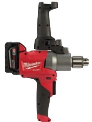
M18 FUEL Mud Mixer w/ 180° Handle