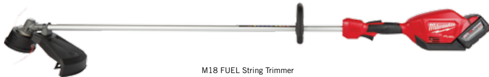
M18 FUEL String Trimmer