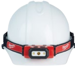
USB Rechargeable Hard Hat Headlamp

MILWAUKEE delivers the industry's first line of trade-focused, high performance personal lights designed to adapt, perform and survive. Built to withstand the toughest conditions on and off the jobsite, MILWAUKEE lights combine the best cordless battery and LED technology delivering convenient, portable solutions that increase productivity and safety.