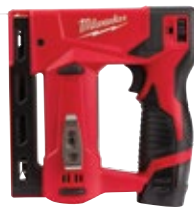
M12 3/8" Crown Stapler