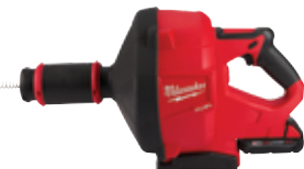
M18 FUEL Drain Snake w/ CABLE DRIVE Locking Feed System