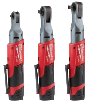
M12 FUEL Ratchets