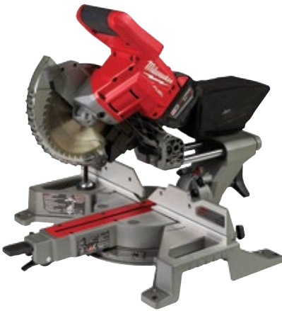
M18 FUEL 7-1/4" Dual Bevel Sliding Compound Miter Saw

As the flagship of the M18 system, M18 FUEL products deliver solutions that are the highest performing tools in their class. Engineered for the most demanding tradesmen, all M18 FUEL products feature three MILWAUKEE-exclusive innovations — The POWERSTATE brushless motor, REDLITHIUM battery pack and REDLINK PLUS intelligence hardware and software — that deliver unmatched power, run-time and durability on the jobsite.