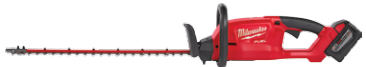
M18 FUEL Hedge Trimmer