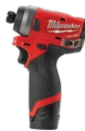
M12 FUEL 1/4" Hex Impact Driver