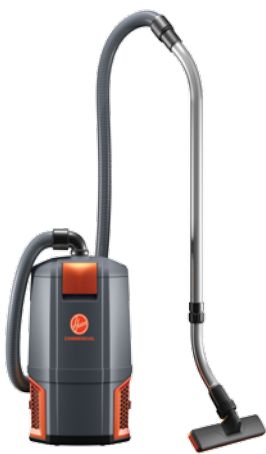
HUSHTONE 6Q Backpack