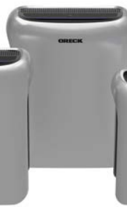
Air Response Large