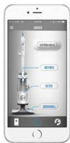
Compatible with HOOVER App