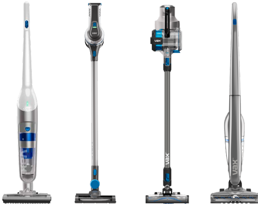
Arrow, Cordless SlimVac, VAX BLADE and Verso

VAX is the UK's No.1 floor care brand offering cleaning products across all the floor care categories and in 2016, the VAX brand has added significant cordless value share in the UK. The Cordless SlimVac has been the jewel in the crown achieving fantastic levels of retail distribution and sales. The VAX brand is continuing to invest in new technologies, which are both innovative and market leading such as the VAX BLADE cordless vacuum to drive the next generation of cordless products that truly meet the changing consumer needs.