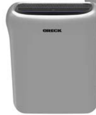
Air Response Medium