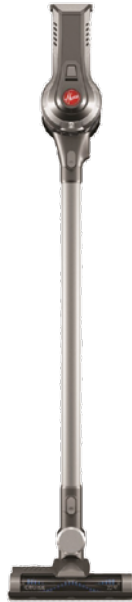
Cruise Cordless Stick