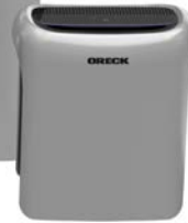
Air Response Small