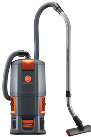
HUSHTONE 6Q Cordless Backpack