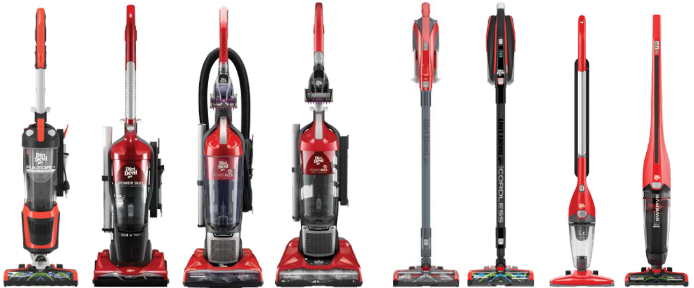
RAZOR VAC Plus

The DIRT DEVIL brand quickly addresses any mess with a portfolio of powerful and easy-to-use uprights, sticks and hand vacuums. With products designed to be lightweight, versatile with quality performance, the DIRT DEVIL brand has just what you need to be “Ready, Set, Done” in no time.