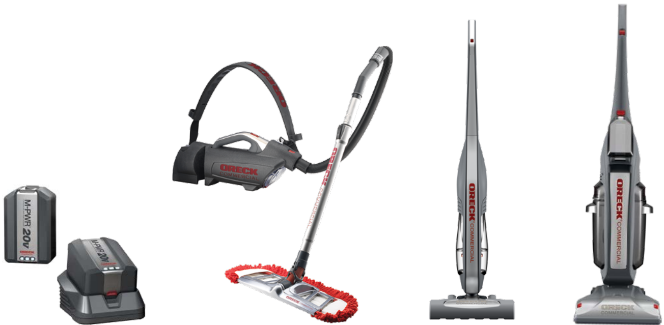
M-PWR 20V Lithium Battery and Charger

ORECK is for the professional who cleans and is looking for Lightweight, Easy to Deploy, Quick Cleaning Tools. ORECK commercial products are ideal for use in food service and hospitality markets.