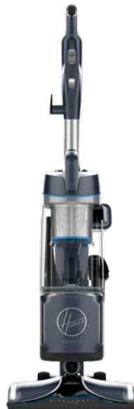
REACT Powered Reach