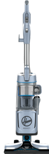
REACT Quick Lift