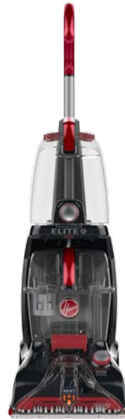
Power Scrub Elite Carpet Washer