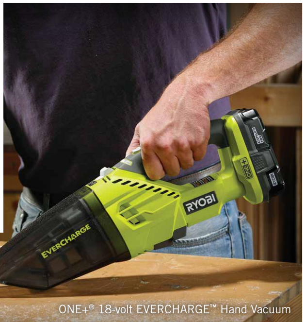
ONE+® 18-volt EVERCHARGE™ Hand Vacuum