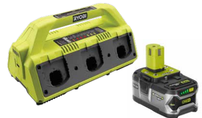
18-volt ONE+® 6-Port Super Charger