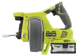
18-volt ONE+® Drain Auger