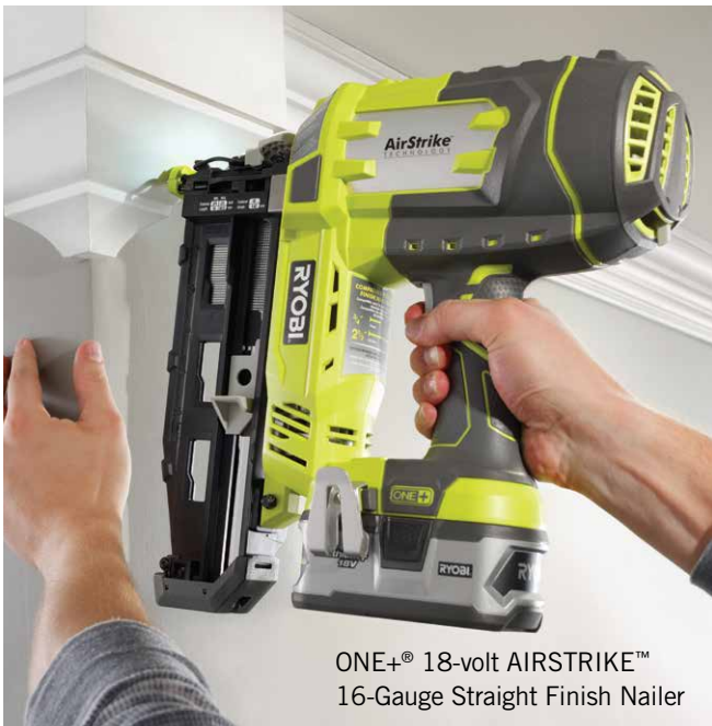
ONE+® 18-volt AIRSTRIKE™ 16-Gauge Straight Finish Nailer