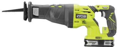
18-volt ONE+® Reciprocating Saw

RYOBI® 18-volt ONE+® DUAL POWER family, featuring the 20 Watt LED Work Light, Fan & Stereo with Bluetooth®