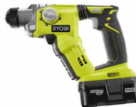
18-volt ONE+® SDS-PLUS® Rotary Hammer