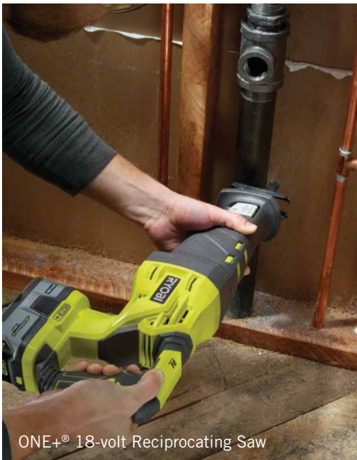
ONE+® 18-volt Reciprocating Saw