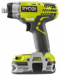
18-volt ONE+® 3-Speed Impact Driver